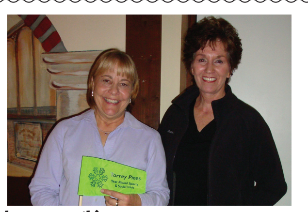
We have something new... ...Buy your Ski Pole Flag

Please submit your name, address, phone or email to anyone on the TPSC Board or send your name to our Torrey Pines address: Torrey Pines Ski Club, PO Box 82087, San Diego, CA 92138-2087. (torreypinesski@aol.com)