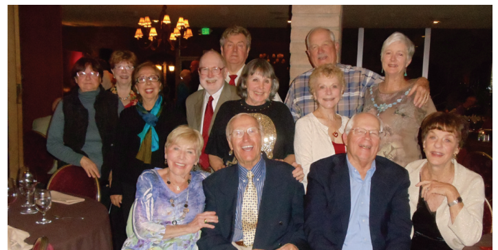
Borrego Springs Dinner Dance