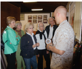
Checking out the Explosive Ordinance

TG = Thomas Bros. Guide followed by coordinates. Please note in case of rain - call the bike leader listed above. Also the ride will depart 15 minutes after the meeting time.