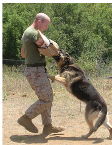
Camp Pendleton Dog Training