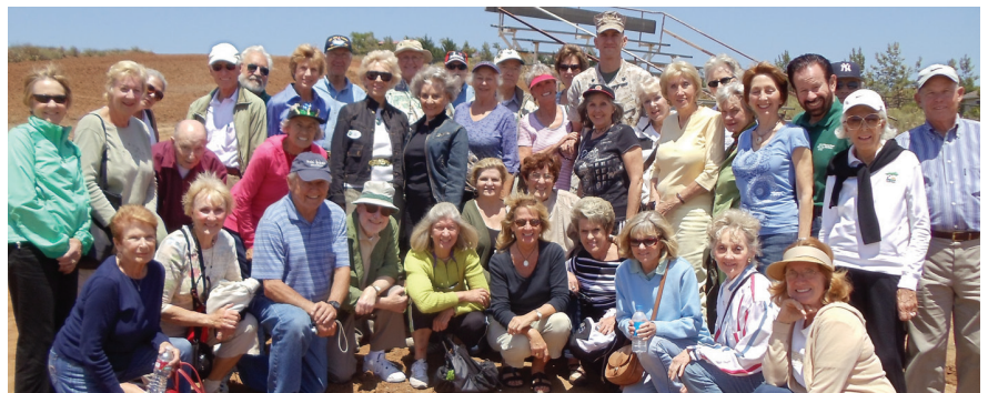
The Camp Pendleton Tour Group!