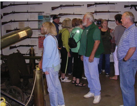
Camp Pendleton weapons