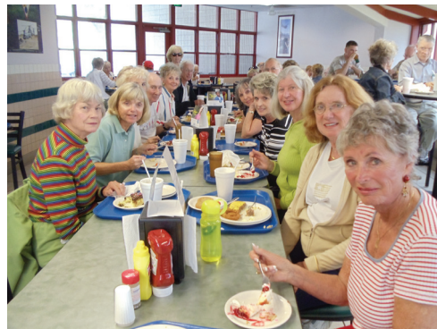
TPSC Members Enjoying Lunch in the Mess Hall