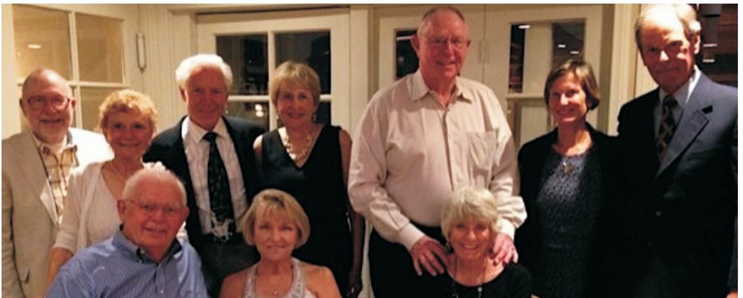
StoneRidge Country Club Dinner/Dance in Poway