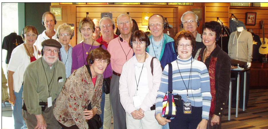
"The group" met at Taylor Guitars for our second informative tour of this interesting factory.