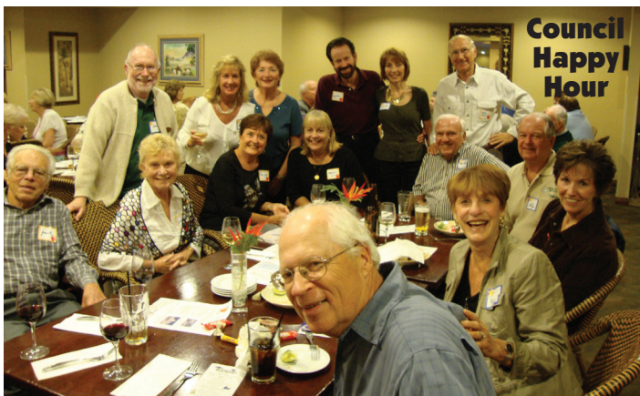
Council Happy Hour