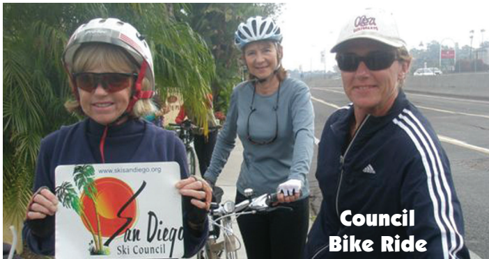
Council Bike Ride

TG = Thomas Bros. Guide followed by coordinates. Please note in case of rain - call the bike leader listed above. Also the ride will depart 15 minutes after the meeting time.