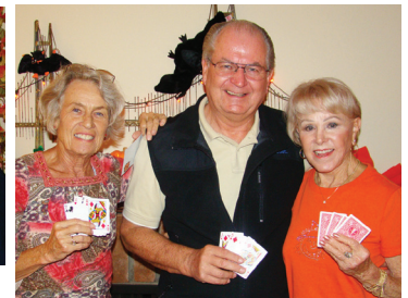
Game Night Winners!