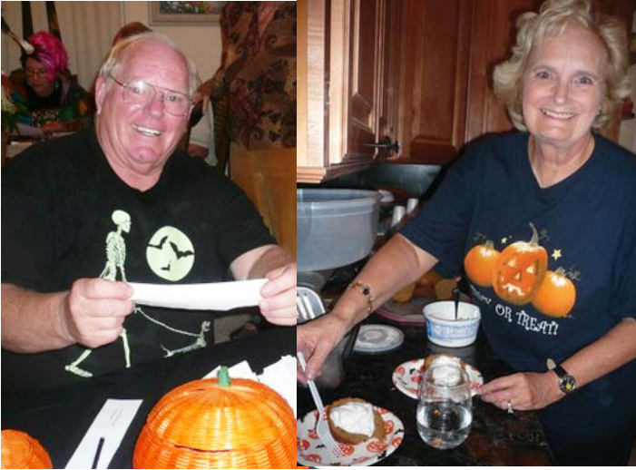
Host and Hostess for the Crazy Bridge Night