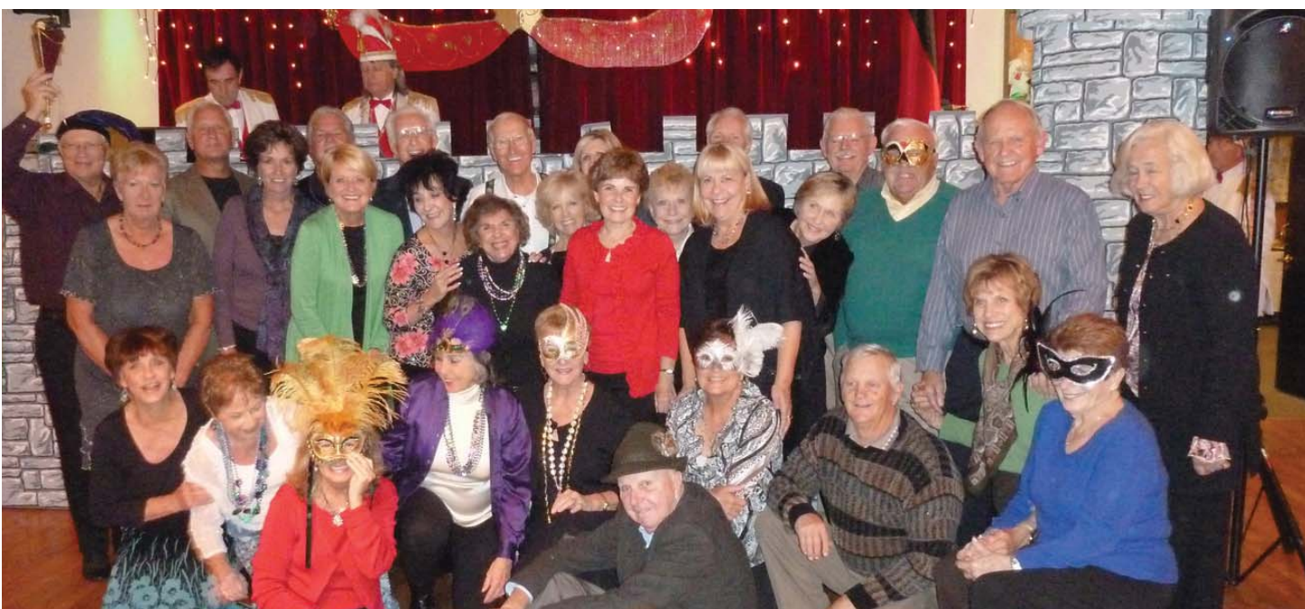
We had 34 TPSC members attend the German American Club Karneval Dinner/Dance! Everyone enjoyed the great German food, live music, the masks, costumes and the various festivities!