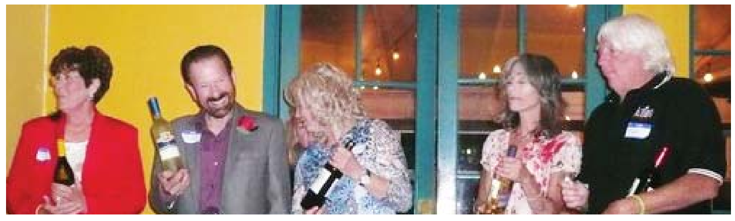
Winners from the Clubs in San Diego