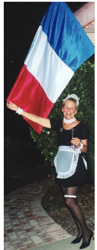
Bastille Day at Susan's