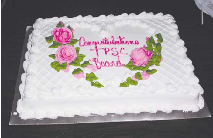
Thanks to our Directors, Officers and Volunteers for 2011-2012