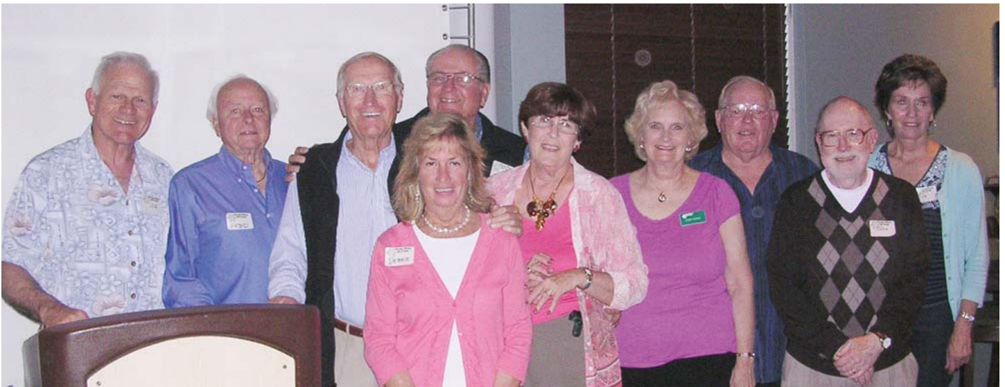
New Officers for 2012-2013