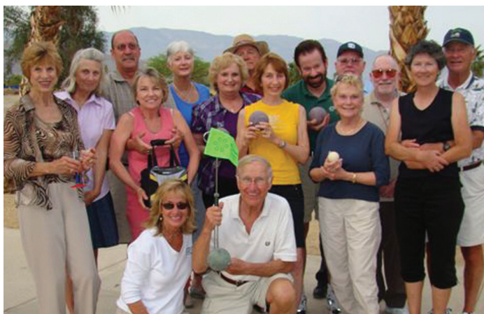
Group shot of bocce ball weekend in Borrego Springs!