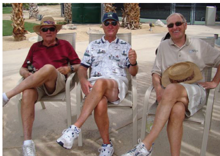
Relaxing after a busy day of bocce ball.