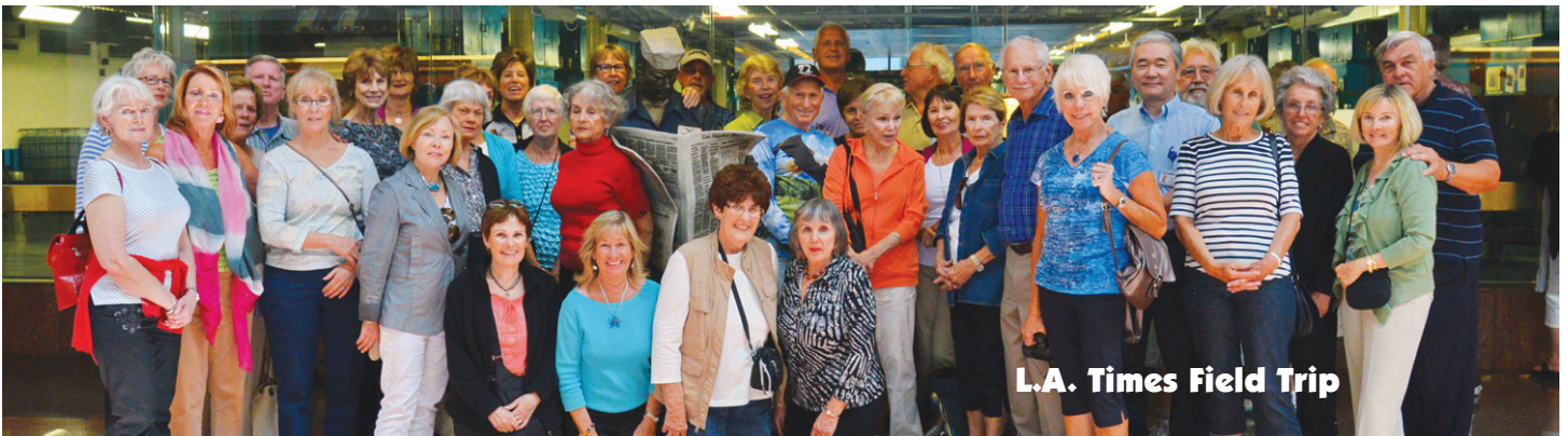
L.A. Times Field Trip