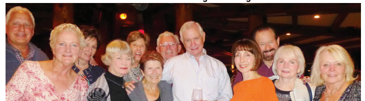
Fun at the January Happy Hour - Joins Us This Month!