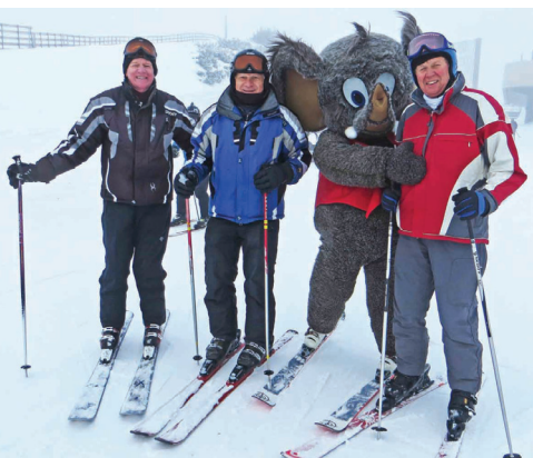
First Mammoth Trip