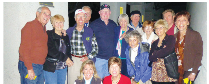
Great Time at the Foreign Film Night!