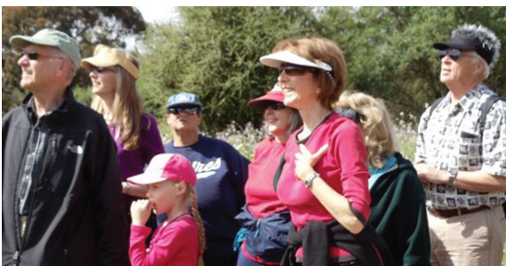
Looking for the bird nest during Tecolote Walk!