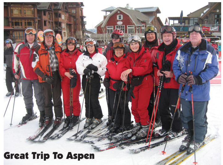
Great Trip To Aspen