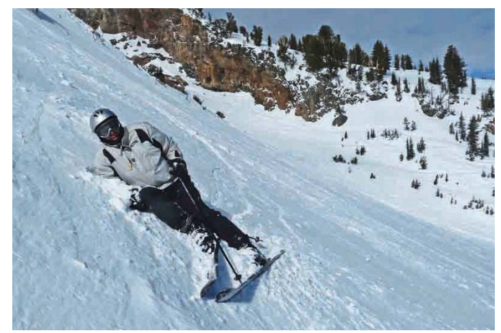
Sometimes we need to rest