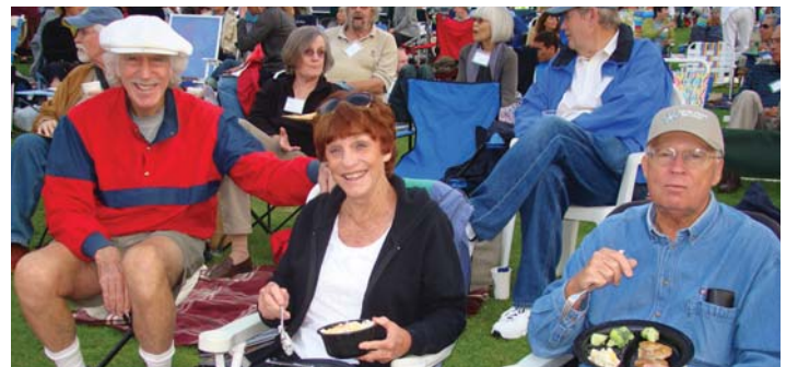
Fun at LJ Summerfest Concert!